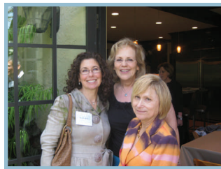
NWC Members enjoy the Palo Alto Luncheon