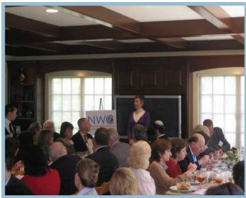
Carly Fiorina speaks to a packed room at the NWC